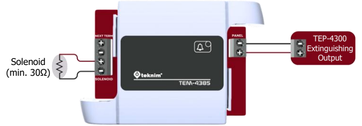
Figure 2 - Wiring for one solenoid