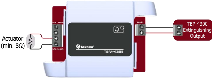
Figure 1 - Wiring for actuator